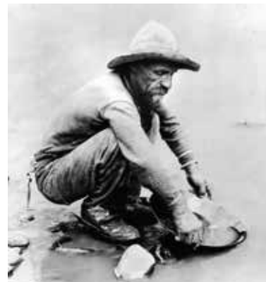
Colorado gold miner, late 1800s.

The Homestead Act was passed by President Lincoln in 1862 and is one of the most important laws in American history. It allowed the federal government to sell land from the public domain to individuals and assisted farmers in acquiring good land at very low prices. Once an individual filed for a homestead claim (up to 160 acres) they had to farm it for 5 years before officially becoming the owner. Additionally, anyone claiming land had to be 21 years or older, head of the household, and a U.S. citizen (or applying for citizenship). Homesteaders had to build a dwelling at least 10' x 12' in size and make improvements to the land (irrigation, corrals, etc.) and must live and farm on the land at least 6 months out of the year.