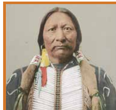
Buckskin Charlie, Sub-chief of the Utes c. 1900

The Camp Creek Valley, which today includes Rock Ledge Ranch, provided the Ute with a temporary home or base camp where they found abundant water and diverse plant life. From here they also had access to the prairie which teemed with herds of buffalo, antelope and other wildlife. Plains Indian tribes, like the Cheyenne, Kiowa, Arapaho, and Apache, passed along this corridor and also appreciated the resources available in the Pikes Peak Region. The Ute Trail passes through Garden of the Gods and the Ranch site. In the mid 19th century, gold discoveries and further western expansion and settlement brought the U.S. government into conflict with the Ute. As a result, the Ute people were removed from this area to reservations in southwestern Colorado and Utah in the 1870s.