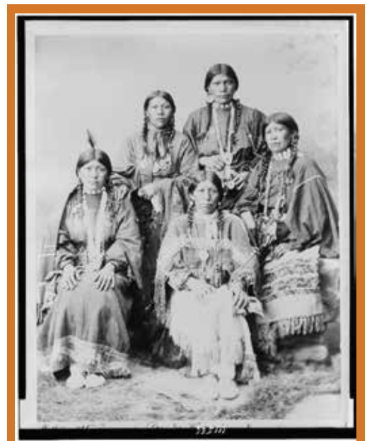
Five Ute women posed c 1899