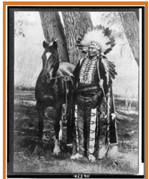
Photograph of Chief Ignacio and his horse